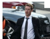
Like a boss.